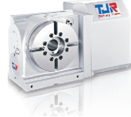
4th Axis CNC Rotary Table