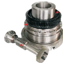
DD MOTOR DRIVE